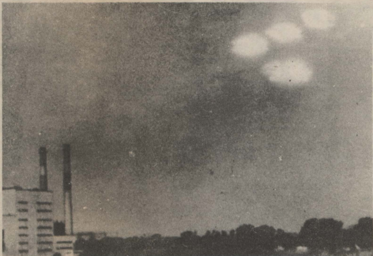
● A U.S. coastguard took this picture at Salem, Massachusetts. The "sighting" was witnessed by other officers.